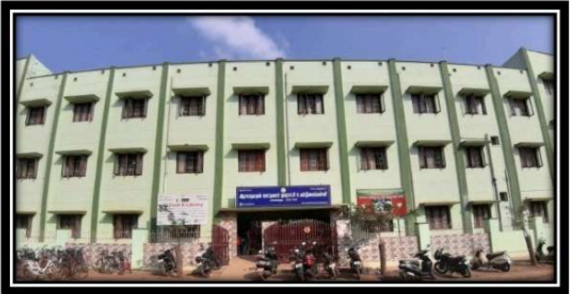
School View - 2017-18

In 2013 -2014 the school had upgraded as high school from middle school. The student strength during 2013 -2014 is 218 with 10 Teachers.