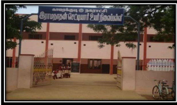
School View - 2013-14

Ramanathan Chettiar Municipal Government High School is situated at the heart of the heritage town Karaikudi in Sivagangai District, Tamil Nadu.